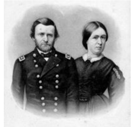
Ulysses and Julia Grant

10:45 AM - Registration 11:30 AM - Introduction of New Members 12:00 noon - Luncheon, followed by program